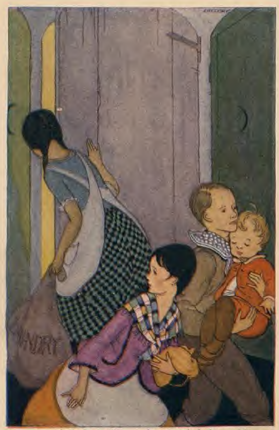
Jess shut the door with as much care as she had opened it